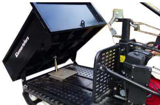
Tipper body Classic Tipper body Flex HI

Length without wheels: 2150 mm Width: 900 mm Weight: 88 Kg Length total: 2150 mm Length w/o wheels 1730 mm Wheel: 4,00-8" Loading capacity 700 Kg