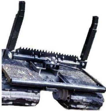
Felling bunk with tow ball Classic, Flex och Essence