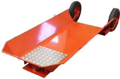
Platform Cart Jointed platform Cart

Part.no. 531 0196-70 Part.no. 531 0196-70-1