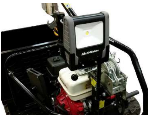
Detachable Working Light LED 20W Incl. bracket

Tailor made storage cover to protect the engine, steering lever and power winch when storing the Järnhästen outside.