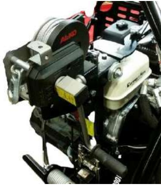
Hand winch Heavy Duty Incl. bracket