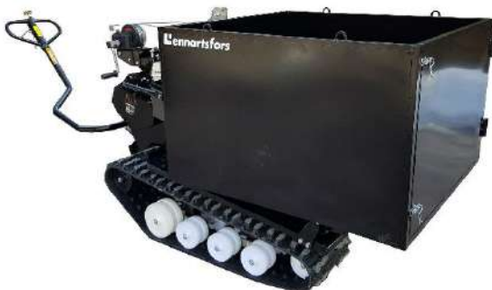
Platform for forest plants

Length: 1080 mm Width: 1070 mm Height: 460 mm Height sides: 290 mm Weight: 60 Kg Loading capacity 800 Kg