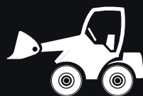
Mini Articulated Loaders