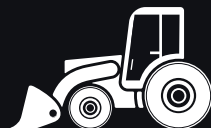
Tractor Front-end Loaders