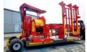
XYLOG 410 mounted on a "floor stand"