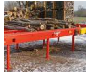
5 m chain loading platform