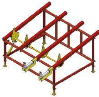
STANDARD loading deck