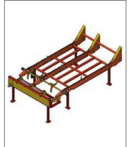
Loading deck with chains