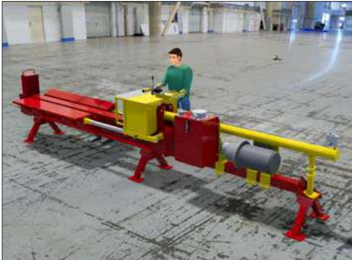
Industrial post splitter