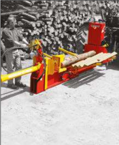
POLYCOMPACT with hydraulic unit