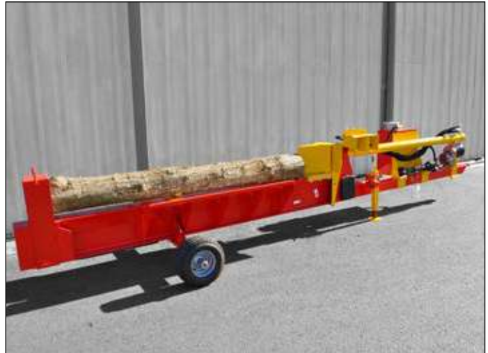
Post splitter TRAILEE