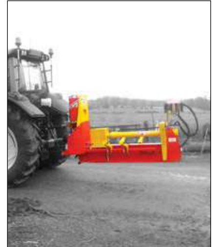
POLYCOMPACT for transport