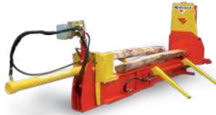
Post splitter POLYCOMPACT