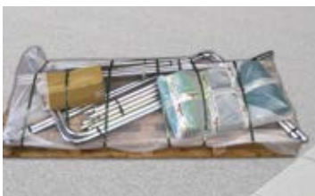
Casing kit for dump truck