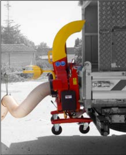
WINDY 491 RE - Hydraulic installation