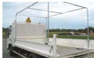
Less than one hour for mounting