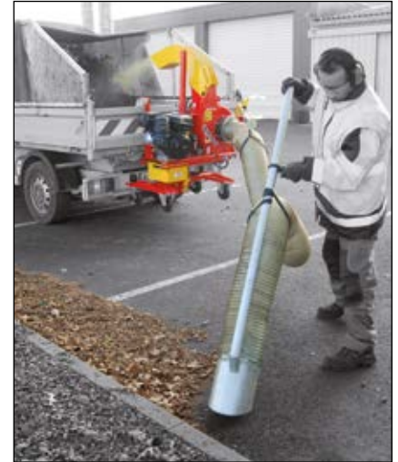
WINDY 491 RE