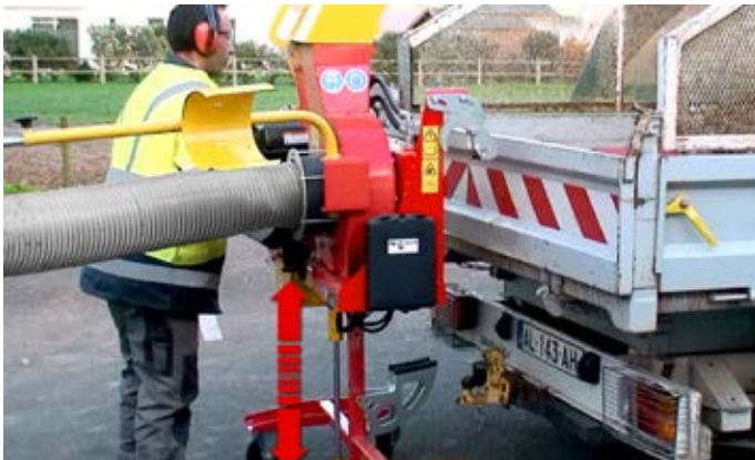
Hydraulic set-up at the rear of the truck, only 1 operator needed