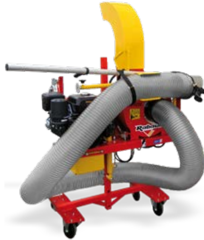
WINDY 491 RE