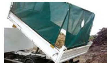
Casing kit door opening for unloading