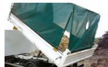
Casing kit door opening for unloading