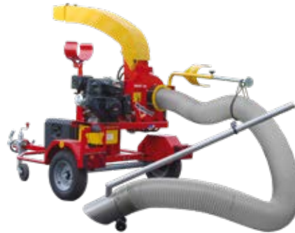
WINDY 491 ME