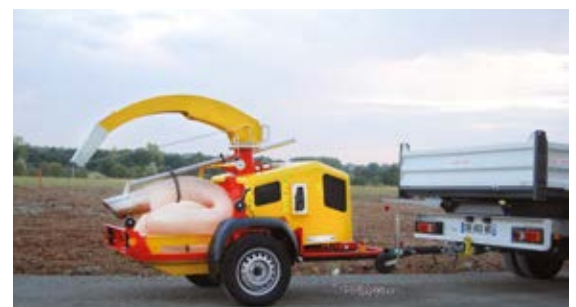
WINDY 660 ME - Transport