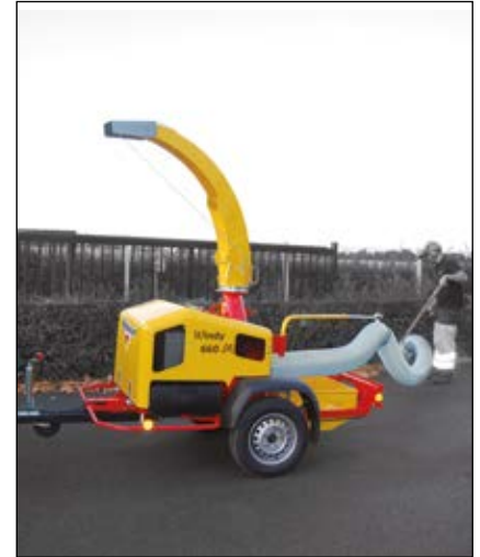
WINDY 660 ME