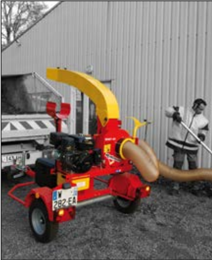
WINDY 491 ME