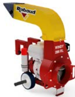
WINDY 286 RL