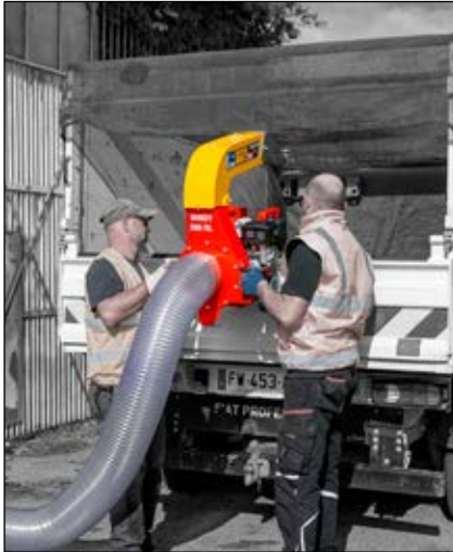
WINDY 286 RL - Manual installation