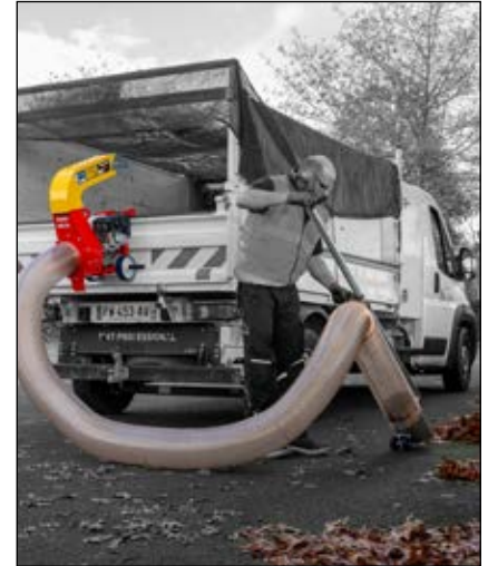
WINDY 286 RL